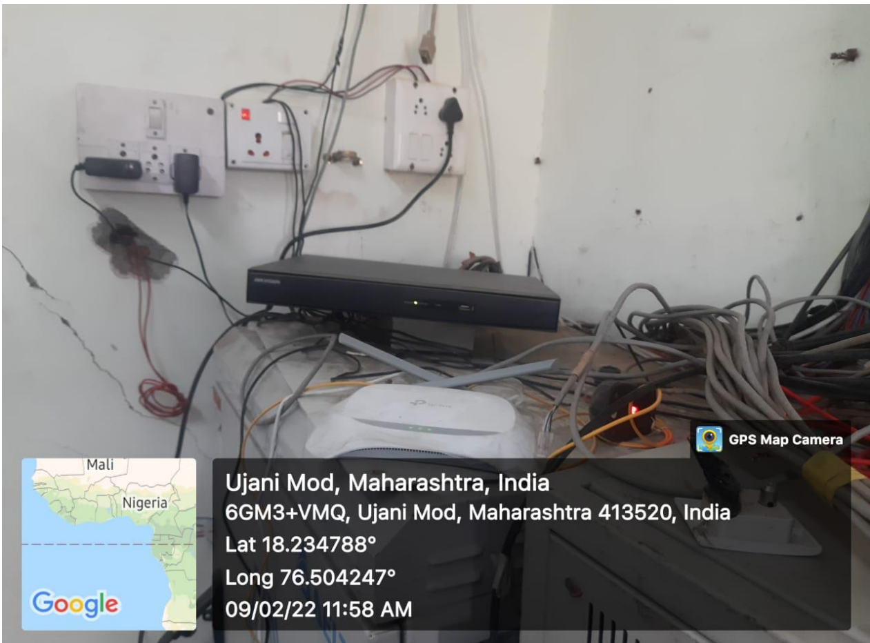
CCTV camera DVRphoto