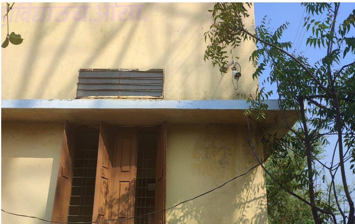
∴ CCTV Camera in ground floor