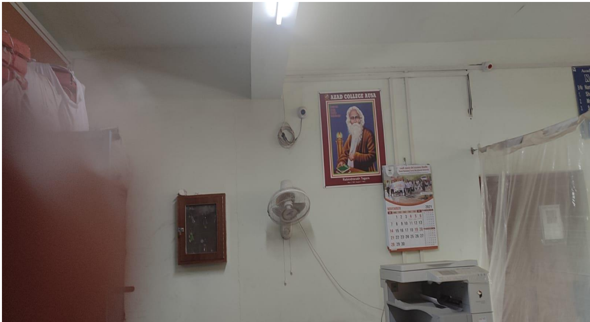
CCTV camera in a Administrative office at ground floor