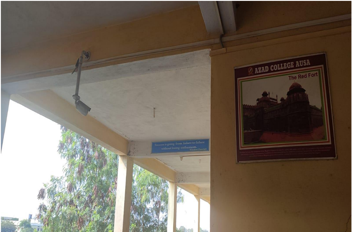
CCTV Camera in Varanda at II nd Floor