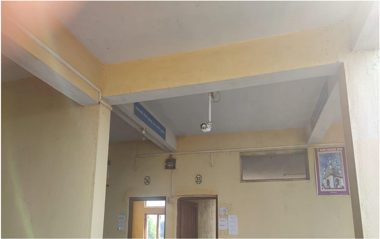
CCTV Camera in Varanda at II nd Floor