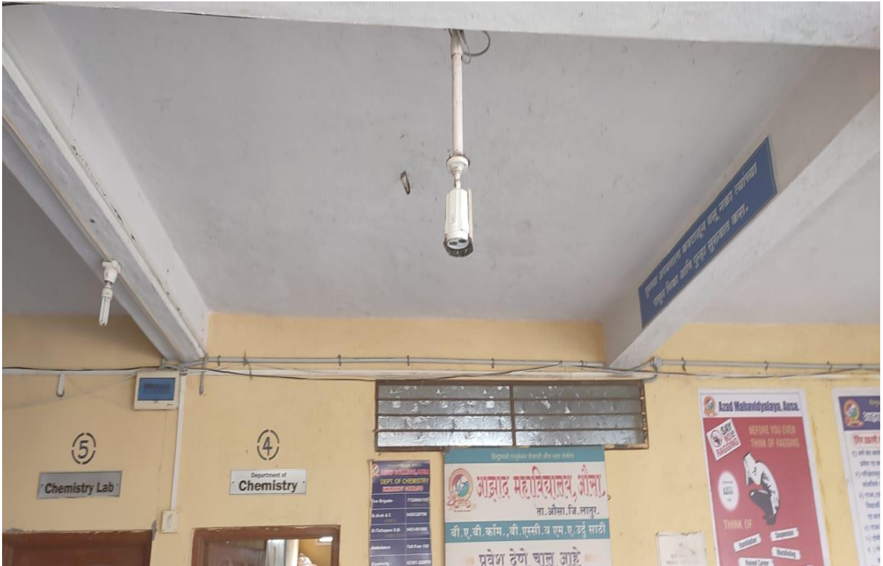
CCTV camera in Varanda at First Ground Floor nearby chemistry Dept.