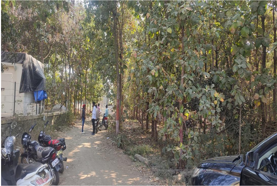
Nature Interpretation Centre