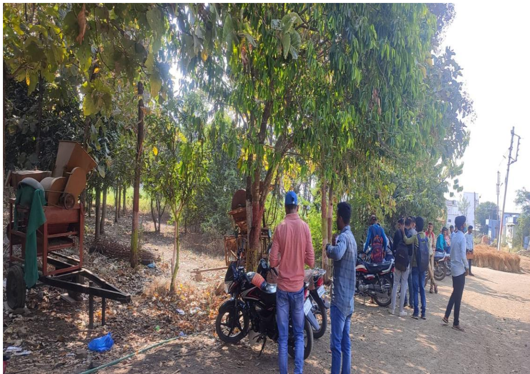
Nature Interpretation Centre