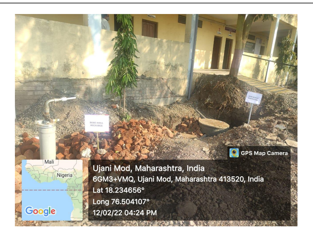
Bore Well & its recharge pit Photograph