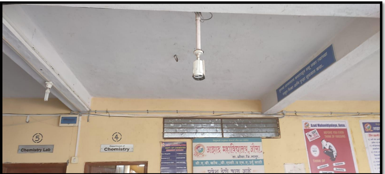
CCTV camera in Varanda at First Ground Floor nearby chemistry Dept.