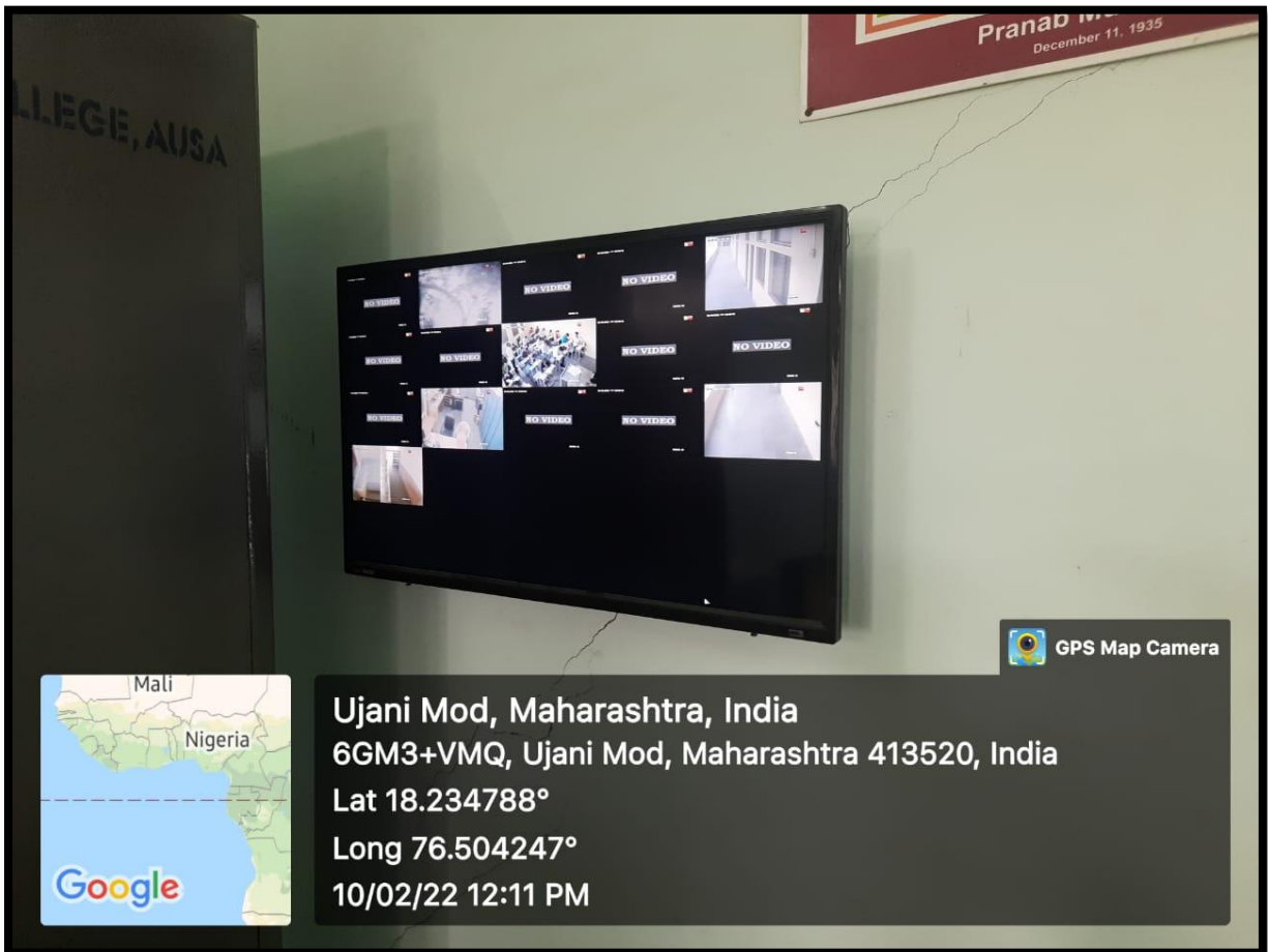
TV Screen showing camera captured images