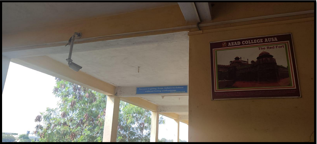
CCTV Camera in Varanda at II nd Floor