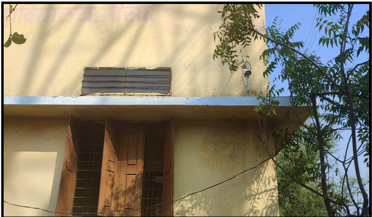
∴ CCTV Camera in ground floor