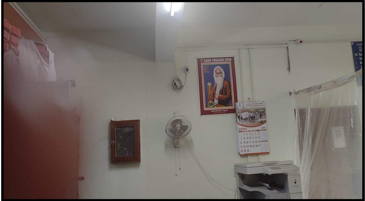
Administrative office at ground floor