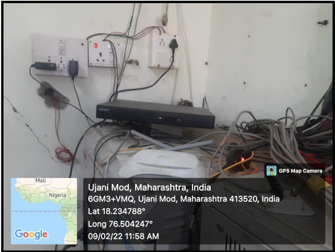
CCTV camera DVR photo