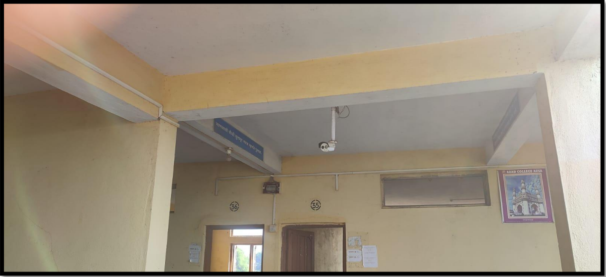
CCTV Camera in Varanda at II nd Floor